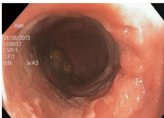
Figure 3 Persistence of ulceration in the sigmoid colon 18 mo post methotrexate and infliximab cessation.

splenic flexure and sigmoid colon ulceration remained consistent with EBVMCU. Ultrasound-guided cores biopsies of the liver lesions showed a polymorphous inflammatory infiltrate with HRS cells which were CD30, CD15, MUM1 and weakly PAX5 positive; negative for CD45, OCT2 and BOB1; and EBER ISH positive; an immunophenotype indistinguishable from