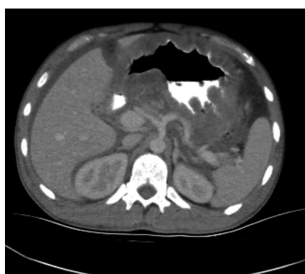
Figure 3 Transverse section of abdominal computerized tomography after 24 h. Hepatic portal venous gas and gastric dilatation regressed dramatically.

in neurons and immune cells, respectively, there is evidence for the presence of these receptors along the gastrointestinal tract [3] . The inhibitory effect of cannabinoids and CB1 receptor agonists on gastric motility and contractility has been shown in animal studies [7,8] . Clinically, cannabinoids have been used to treat hyperemesis in patients undergoing chemotherapy, and this effect is mediated by CB1 receptors [9] . Paradoxically, Choung et al. [10] and Allen et al. [4] have reported an association between chronic cannabinoid use and cyclical hyperemesis. Additionally, cannabinoids can affect the lower esophageal sphincter by binding to CB1 receptors within the nucleus tractus solitarius [11] . As shown, there are different aspects of the effects of cannabinoids on the stomach. In the