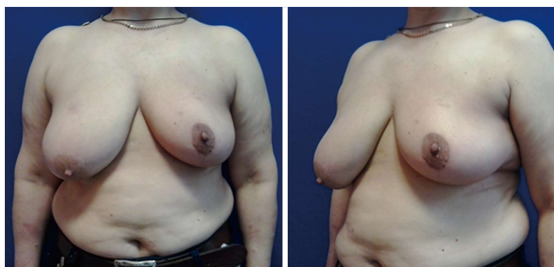
Figure 3 Appearance of a 49-year-old woman after underwent oncoplastic breast conserving surgery and posterior adjuvant chemotherapy and radiotherapy. She had a bifocal invasive lobulillar carcinoma situated at intersection of upper quadrants with positive estrogenic and progesterone receptors and T 2 N 0 M 0 pathological staging. She presents breast asymmetry which she wants it to be corrected.

procedures, patients preferring an all-in-one operation willing immediate symmetrization and patients desiring optimal aesthetic results; only patients belonging to the second group are candidates to immediate contralateral symmetrization. In our experience, our average patient is in the first group. Figure 3 shows the appearance of a patient belonging to third group with breast asymmetry which she wants it to be corrected; we will carry out symmetrization of the right breast when she stabilized her weight because she put on weight during chemotherapy treatment.