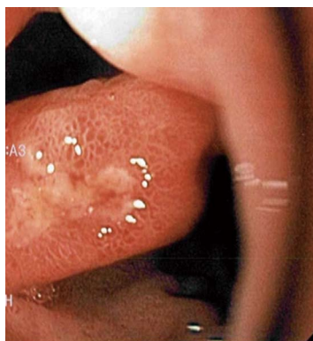
Figure 2 Initial endoscopy showing residual duodenal ulceration after repair.

parasitic infections. Peripheral eosinophilia is seen in up to 80% of cases, but is not mandatory for diagnosis. EGE may be classified as predominantly mucosal (60%), muscular (30%), or serosal (10%), and can occur in any segment of the GI tract [4] .