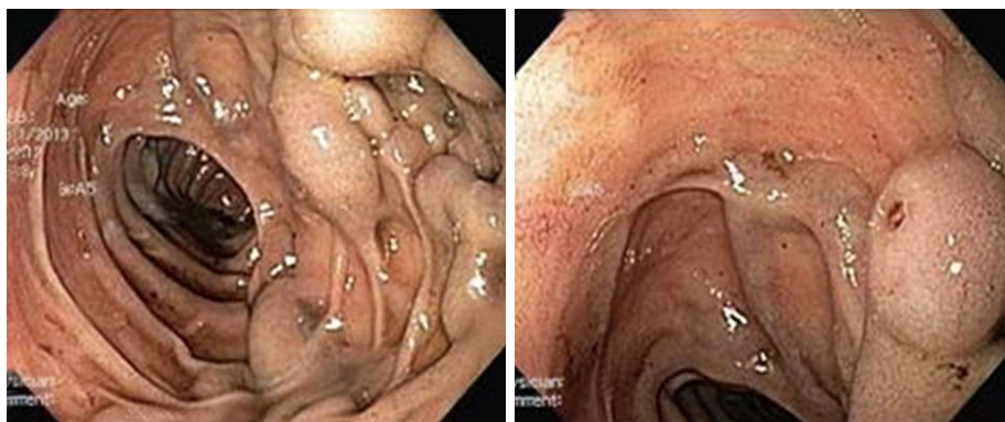
Figure 1 Isolated varices in the second portion of the duodenum with red wale sign.