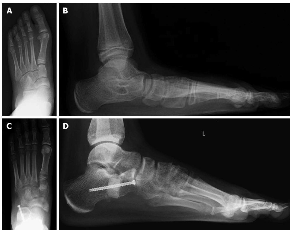
Figure 4 Preoperative anteroposterior (A) and lateral (B) views weightbearing X-rays in a child with a flexible flatfoot; on the anteroposterior view, note about 50% of talonavicular uncoverage; postoperative anteroposterior (C) and lateral (D) weightbearing views following a lateral column lengthening and cotton osteotomy. Note the excellent correction of the talonavicular uncoverage (C) and Meary's angle (D).

should be trapezoid shaped as opposed to triangular (Figure 4). Fixation of the graft is not necessary, unless grossly unstable. Potential complications of LCL include lateral foot pain, nonunion, sinus tarsi impingement (typically when the osteotomy is too posterior), and a slight dorsal subluxation of the distal calcaneus (creating prominence of the anterior process of the calcaneus subcutaneously).