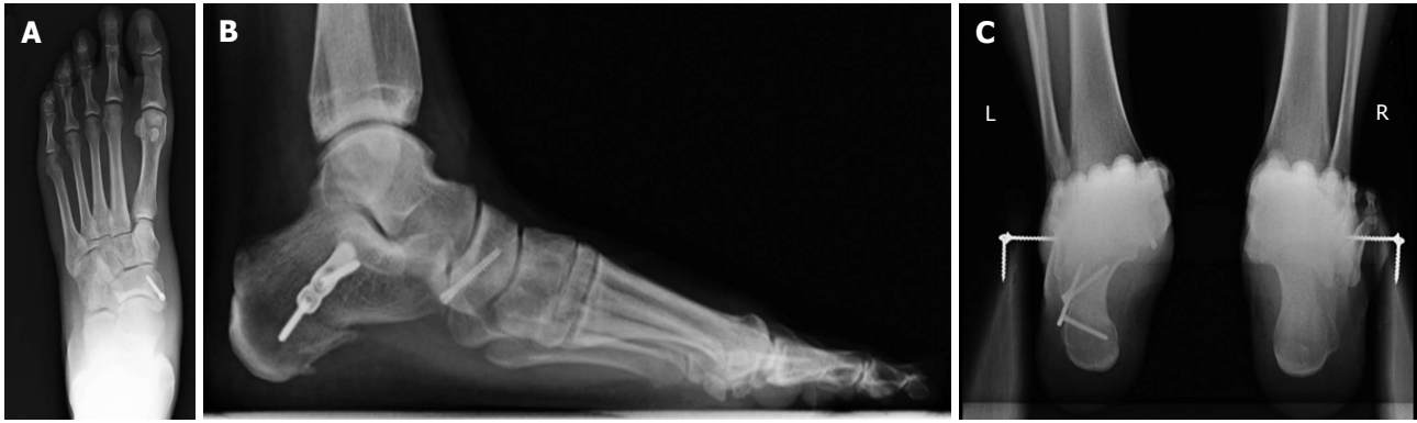
Figure 3 Postoperative weightbearing anteroposterior (A), lateral (B), and hindfoot (C) views of the left foot in a patient with a painful accessory navicular syndrome treated with a medializing calcaneal osteotomy and fusion of the accessory navicular with a screw. Note correction of the talonavicular uncoverage (A), Meary's line (B), and hindfoot valgus (C).

ciated with this condition result from the disruption of the synchondrosis between the navicular and the accessory bone. As the synchondrosis is stressed, disruption of the attachment of the accessory navicular and thus of the posterior tibial tendon occurs. Another source of pain comes from pressure in the shoe secondary to an uncorrected pronated flatfoot.