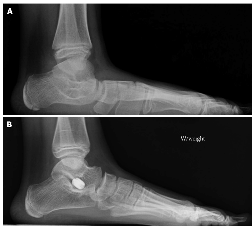
Figure 2 Weightbearing lateral view X-ray of the left foot prior (A) and post (B) subtalar arthroereisis. Note correction of Meary's angle as well as correction of the hindfoot valgus.

subtalar joint will be limited. An important point here is that the goal of this operation is simply to limit excessive eversion of the hindfoot. If the prosthesis is too small, correction of hindfoot valgus will not be obtained, and dorsiflexion of the foot through the subtalar joint will persist. The appropriate size should limit abnormal subtalar joint eversion and allow for a few degrees of remaining eversion only.