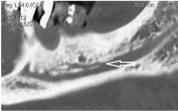
Figure 1 White arrow showing the origin of a mandibular canal branch in the mandibular body found by Rouas et al [13] (2007) on a computed tomography exam.