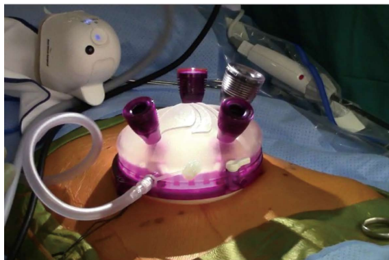
Figure 1 Single incision laparoscopic surgery colorectal set-up.

For pelvic or cases requiring access to multiple quadrants, a Pfannenstiel incision may be favorable. In these cases, a 4 cm skin incision is made, and the underlying fascia is opened to 4 cm. In cases where a stoma is planned, the predetermined ostomy site may also be used for the SILS port, resulting in “scarless” surgery [7,33-35] .