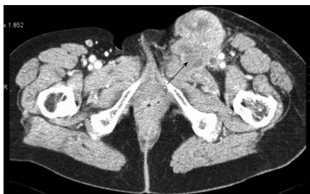
Figure 2 Axial cut computed tomography angiogram demonstrating proximity of a soft tissue sarcoma to the adjacent femoral vessels (arrow).