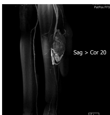
Figure 4 Antero-lateral projection of reconstructed magnetic resonance angiogram of left proximal calf demonstrating the tumour mass in relation to adjacent vascular structures.

Post-operatively, the patient's wound healed without complication. In view of the necessary vascular reconstruction, anti-coagulation with warfarin was commenced. At one month post-operatively however, she required ileo-femoral-popliteal thrombectomy for graft thrombosis. The patient completed a course of adjuvant radiotherapy to the tumour bed (66 Gy in 33 fractions).