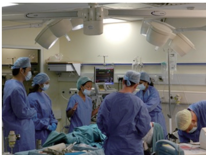
Figure 3 A typical operating room scenario used during the course.

training on the residency program was 2.6 (out of the 6 training years required in the United Kingdom).