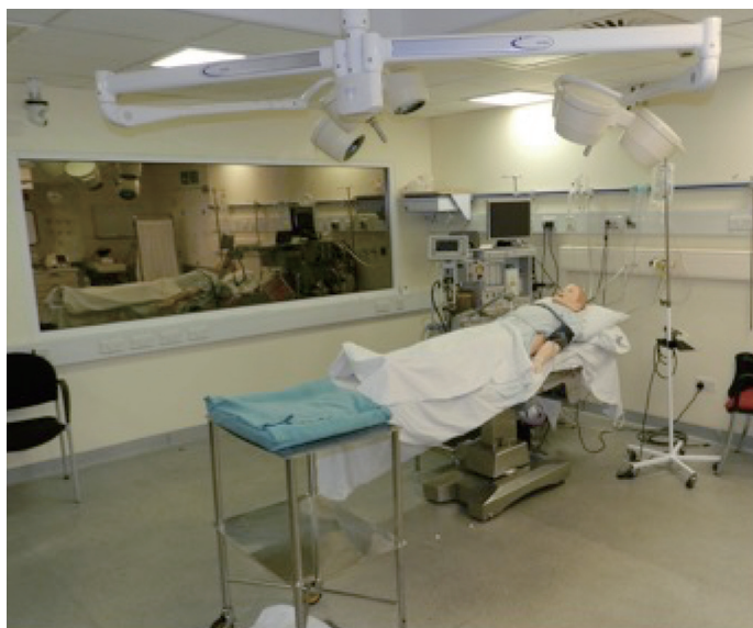
Figure 1 Mock operating room with viewing room behind one way mirror.