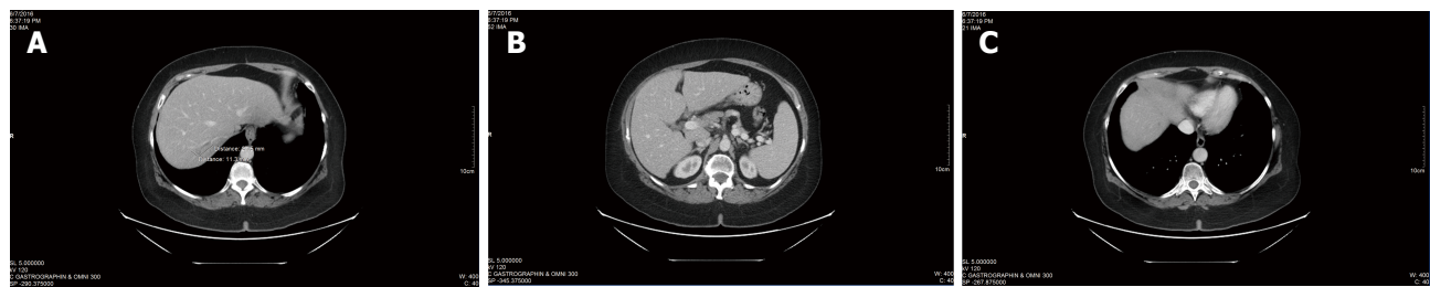
Figure 3 Abdominal computerized tomography scan after 3 additional months of integrative therapy (dichloroacetate sodium + 5-fluorouracil + natural medicines), followed by nearly 4 years of dichloroacetate sodium without any concurrent conventional cancer therapies. Scans demonstrate absence of cancer re-growth and absence of new liver metastases. Same slices as Figure 1 are shown. A: 11.3 mm × 27.5 mm liver metastasis; B: No metastases visible; C: No metastases visible.