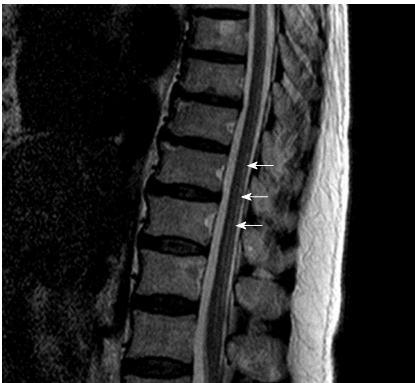
Figure 2 T2-weighted sagittal magnetic resonance image of the thoracic spinal cord in the patient. The white arrows indicate high signal intensity in the posterior column.