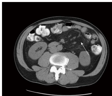
Figure 5 Inflammation of the small bowel adipose tissue formed as a pseudotumor in the left abdomen in the transverse abdominal computed tomography (white arrow).

A healthy 56-year old male patient presented with history of pain in the lower abdominal quadrant for 3 to