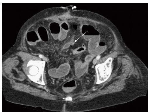
Figure 4 Transverse abdominal computed tomography scan shows a nonspecific inflammatory process involving the adipose tissue of the small bowel mesentery.

clinic 4 wk later, remained asymptomatic.