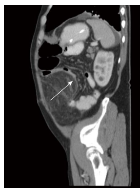
Figure 2 Sagittal abdominal computed tomography scan with an unclear mass in the omental fat with obstruction of the small intestine (white arrow).

course, the patient developed symptoms of incomplete intestinal obstruction with vomiting and diarrhea on the third postoperative day. Moreover, the temperature rose to 101.3 degrees Fahrenheit. On clinical examination, the patient was very tender over his left hemiabdomen. The blood work revealed a dramatic elevation of the C-reactive protein (CRP) to 478 mg/L (normal: Less than 3 mg/L) and a white blood cell count of 16.1 G/L (normal: Less than 10.0 G/L). An abdominal computed tomography (CT) showed an unclear mass of 15 cm × 8.8 cm × 7.8 cm in the left hemiabdomen (Figures 1 and 2), consisting of omental fat and causing a partial intestinal obstruction. After administration of intravenous antibiotics (tazobactam/piperacillinum) and conservative treatment of the bowel obstruction with insertion of a naso-gastric tube and rectal catheter, the patient's general condition improved and the bowel function normalized over the following days. The abdominal tenderness disappeared and the blood values returned to within normal limits. The patient was discharged with oral antibiotics (amoxicillinum/acidum clavulanicum) on postoperative day 20 in good general condition. The patient, who was seen in the outpatient