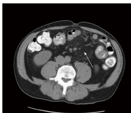
Figure 6 Signs of sclerosing mesenteritis with lymphadenopathy in the lower left abdomen in the transverse abdominal computed tomography (white arrow).

4 mo, provoked by exercise. The patient's past medical history was uneventful, with no weight loss, no episodes of fever or shivering, no evidence for dysfunction of the gastrointestinal tract, and no previous abdominal surgeries. The patient underwent a screening colonoscopy without any pathologic findings. A clinical examination revealed abdominal distention in the left lower quadrant without peritonitis or resistance. An abdominal CT scan showed an inflammatory infiltration of the mesenteric adipose tissue with lymphadenopathy, interpreted as sclerosing mesenteritis without evidence of malignancy or other pathology (Figures 5 and 6). The pain declined further in the course spontaneously without any treatment.