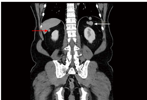
Figure 2 Coronal computed tomography image of the pelvis. White arrow pointing to nodular soft tissue mass in left upper quadrant, where discrete spleen was not visualised; red arrow pointing to soft tissue mass beneath liver.