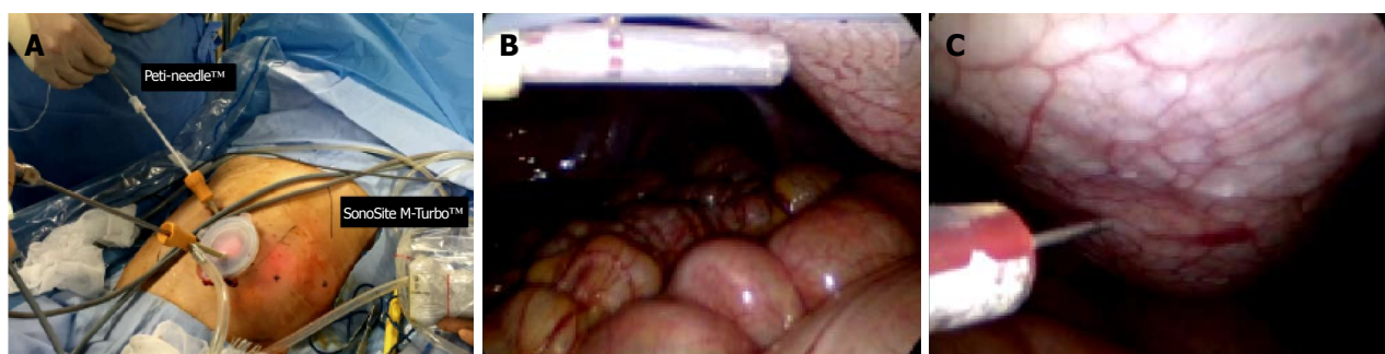
Figure 1 Intraoperative photographs. A: The Peti-needle™ inserted via the naval port (5 mm); B: Delivered to the peritoneum; C: The anesthetic agent was then injected through the Peti-needle™ by the transperitoneal approach under laparoscopic visualization.