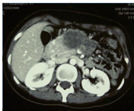
Figure 1 Preoperative computed tomography view of a 26-year-old female patient with a diagnosis of pseudo-papillary tumors. The figure shows that the lesion occupied the body and neck region with necrosis of the tail on preoperative computed tomography imaging. Normal pancreatic tissue is observed in the ventral pancreas region.

The surgical procedures were performed by one group of experienced surgeons in our department of pancreatic surgery. We performed a complete Kocher