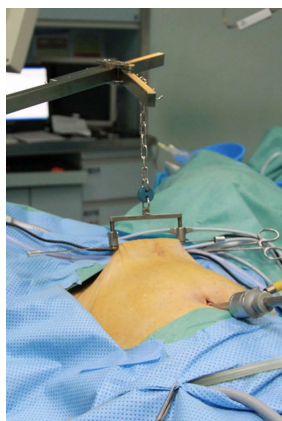
Figure 1 The subcutaneous abdominal wall lift system. The steel scaffold was fixed to the operating table. A sterilized needle was inserted through the subcutaneous tissue and drafted by a retractor to lift the abdominal wall.

without distant metastasis were eligible for enrollment in the study. All operations were performed by the same surgical group with considerable experience in advanced laparoscopic gastroenterological surgery.