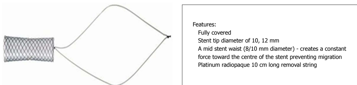
Figure 2 Fully-covered modified self-expanding metal stent used in the management of biliary strictures complicating Living donor liver transplantation. The Kaffes stent (Taewoong Medical, Seoul, South Korea) is shown.

ring endoscopic/percutaneous interventions [9,14,31,69,91] . It would seem beneficial to study these patients at two time points - one assessing the response after a protocol-based endotherapy practice for a minimum of 1 year, and a more long-term evaluation to assess rate of recurrence and need for repeat interventions. Both these treatment endpoint scans provide valuable insights on the course of AS and will help in establishing a uniform treatment protocol and follow-up.