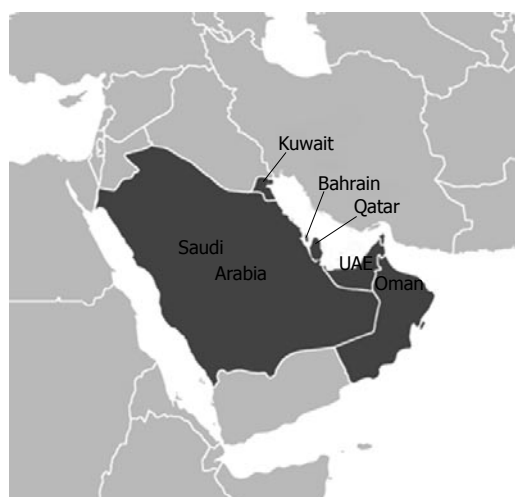
Figure 1 Map of Middle East Gulf States. UAE: United arab emirates.

(IE) specifically tricuspid valve endocarditis (TVE), pneumonia, pulmonary tuberculosis, septicemia, transmission of blood-borne infections (human immune deficiency virus (HIV)/hepatitis) and have also impacted on increased mortality due to overdose [2] . However, there is a paucity of data with respect to the incidence of tricuspid valve endocarditis in this region, probably due to under-diagnosis or underreporting. In addition, there is a lack of epidemiological studies documenting the burden of disease in terms of prevalence and related morbidity and mortality due to drug abuse in this region. This review article summarizes the epidemiology of illicit drug abuse in the Middle East Gulf Region (Figure 1) in relation to the diagnosis and treatment of TVE.