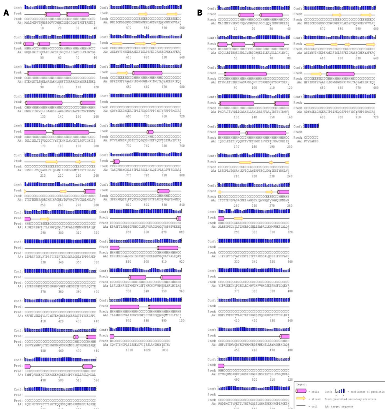
Figure 3 Secondary structures of wild-type and mutated CNKS2 proteins predicted by PSIPRED. A: The wild-type CNKS2 gene encodes an intact peptide chain of 1034 amino acids; B: The mutated CNKS2 gene leads to an early termination of the synthesis of the peptide chain and only No.1-728 amino acids are expressed.

psy-aphasia syndrome. The early diagnosis and early use of antiepileptic drugs as well as hormone therapy can recover speech comprehension to different degrees and improve abnormal discharge. Therefore, the overall prognosis of patients is good. Clinical seizures should be treated with antiseizure drugs, and barbiturates, carbamazepine, and phenytoin should be avoided as they can potentiate spike wave discharges during sleep [24,25] . Although there is evidence that mutations or deletions of CNKS2 lead to neurological development defects, such as epilepsy and intellectual disability, the pathogenesis remains unclear. Therefore, the next step is to screen a large number of epileptic encephalopathy individuals to