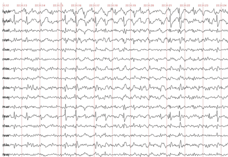
Figure 1 Electroencephalogram of the patient. It showed generalized continuous spike-and-wave patterns in the bitemporal and frontal lobes, noticeable on the left side. Abnormal discharge was more pronounced during the sleep-electroencephalogram. Slower on background activity.

ts N-methyl-D-aspartate (NMDA) receptors to neuronal cell adhesion molecules [14] . The NMDA subunit encoded by GRIN2A is the first gene associated with EAS [2] . GRIN2A mutations reduce NMDA receptor trafficking and agonist potency–molecular profiling as well as functional rescue [15] . GRIN2A gene is a rare causative gene in Chinese patients with EAS, suggesting the possibility of other genes being involved in the pathogenesis [16] . Hence, we speculate that a mutation or deletion of CNKS2 may result in changes to the NMDA receptor activity and might affect downstream signaling cascades. Abnormal NMDA receptor will potentially damage the cortical thalamus network during sleep [17] . CNKS2 is highly expressed in the brain (especially in the hippocampus, amygdala, and cerebellum), and mutations result in loss of specificity and might also affect brain function [7] , leading to seizures and neurodevelopmental disorders that especially affect the patient's speech expression [2] . CNKS2 is a gene located on the X chromosome, and its mutations or deletions lead to X linkage intelligence disorder (XLID) [8] . The main features of XLID are: (1) intellectual disability; (2) highly restrictive speech (especially expression of language); (3) ADHD; (4) transient childhood epilepsy; and (5) epilepsy with continuous spike waves of slow-wave sleep (CSWS) in early childhood [5] .