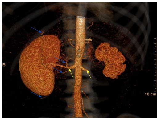
Figure 1 Three-dimensional computed tomography reconstruction. Extensive collateral blood supply to the right kidney (blue arrows) and origins of the renal arterial stenosis (yellow arrows) are shown.