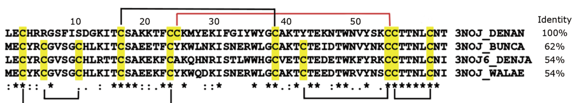
Figure 2 Alignment of amino acid sequence of toxin Tx7335 with those of nonconventional toxins. Cysteine residues are marked in yellow. Black lines indicate the locations of the typical disulfide bond in nonconventional toxins; red line indicates the unusual disulfide bond 25-55 in Tx7335. 3NOJ_DENAN: Toxin Tx7335 from Dendroaspis angusticeps (Eastern green mamba); 3NOJ_BUNCA: Bucandin from Bungarus candidus (Malayan krait); 3NOJ6_DENJA: Toxin S6C6 from Dendroaspis jamesoni kaimosae (Eastern Jameson's mamba); 3NOJ_WALAE: Actiflagelin from Walterinnesia aegyptia (desert black snake).