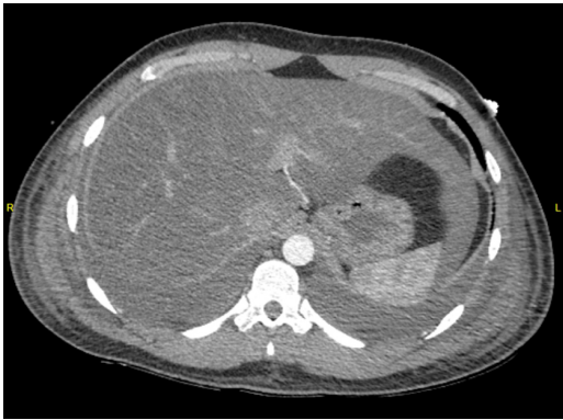
Figure 2 Poor contrast enhancement of liver parenchyma in arterial phase in Case 1.