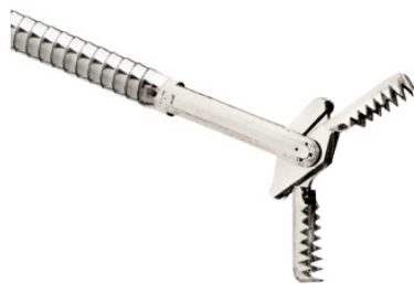
Figure 1 Image of Moray™ microforceps (US Endoscopy, OH, United States).

sent for CEA and cytology. A minimum of 1 mL of intracystic fluid was aspirated and sent for CEA and amylase level. An experienced pathologist evaluated all the specimen and cytology. If IPMN was suspected, immunostaining was performed to determine the subtype. After the procedure, patients were followed up for any possible adverse events including abdominal pain, pancreatitis, or perforation.