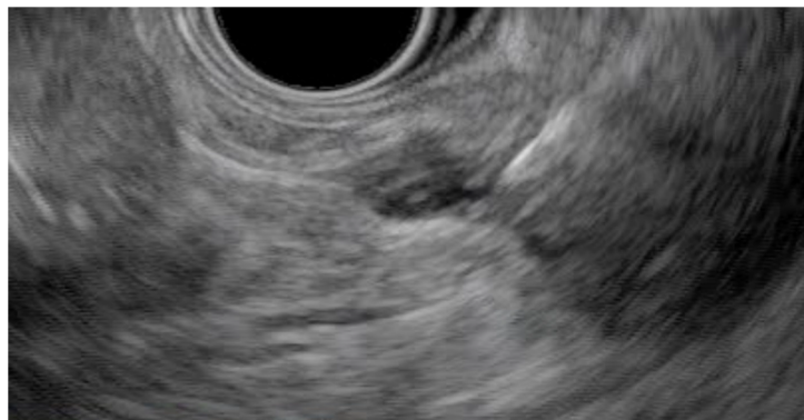
Figure 3 Endosonographic image of the microforceps bite of the wall tenting tissue within a pancreatic cystic lesion.

subtype and we do need to keep in mind that IPMN subtype based on EUS-TTNB may not represent the predominant subtype of the entire PCL in some cases.