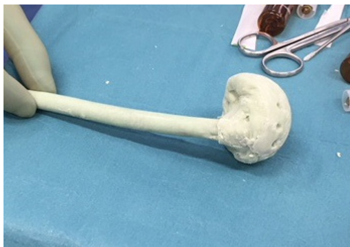
Figure 1 Custom made spacer of the shoulder joint.

institution we still favor the potential advantage of a well fitted custom-made stemmed spacer being aware of the fact that there is limited evidence for optimal treatment even in the setup of prosthetic shoulder infections [33,34] . Definitive treatment with antibiotic spacer has been shown to be a reliable option in low-demand patients. There is a potential risk of glenoid erosions that could put in jeopardy a future reimplantation [24,35] . This option should therefore be carefully discussed with the patient.