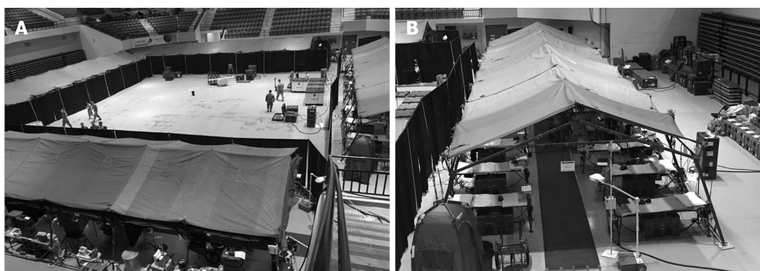
Figure 2 The Emergency Medical Treatment section, Pharmacy, Laboratory, as well as inpatient wards were set up within the arena. A: Emergency Medical Treatment, Intensive Care Unit and Intermediate Care Ward sections arranged around the periphery of the arena. The central portion of the arena was used for storage of equipment and supplies; B: Intensive Care Unit section and associated equipment. There were two 20 bed Intensive Care Unit sections, one 10 bed Emergency Medical Treatment section, and one 20 bed Intermediate Care Ward section.