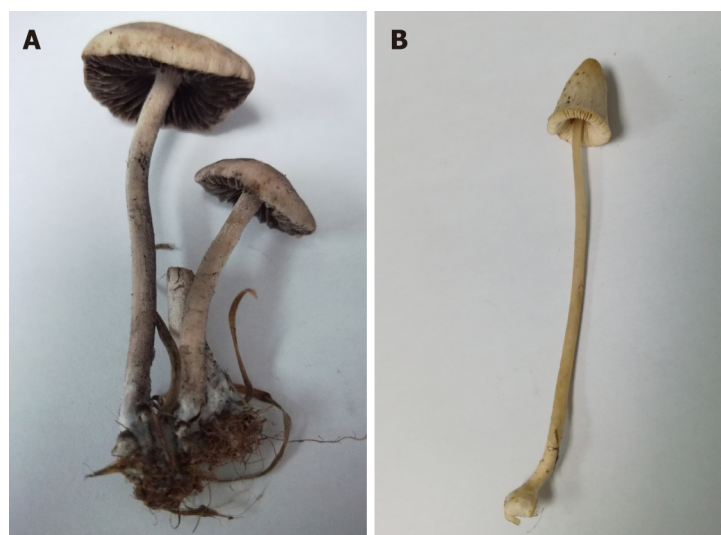
Figure 2 Two kinds of toxic mushrooms involved in the case. A: Panaeolus subbalteatus ; B: Conocybe lactea .

palpitation, chest discomfort, dizziness, recurrent syncope, and seizure, followed by sudden death, in patients linked to mushroom ingestions. Ventricular tachycardia and ventricular fibrillation may precede death [7] . The mechanisms of cardiovascular damage were suggested to be related to peripheral sympathomimetic stimulation by psilocybin, which were contained in both of the toxic species of mushrooms we have identified here [5] . Unfortunately, almost none of the authors succeeded in the identification of the species of mushroom that causes unusual cardiovascular toxicity.