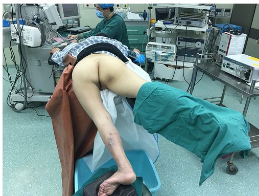
Figure 2 Patient positioning in the modified prone split-leg position due to limited movement of her left hip.