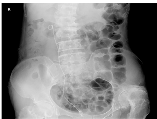
Figure 4 X-ray of kidney, ureter, and bladder shows stent position and no visible stone in ureteral area after operation.