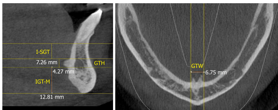
Figure 2 Measurements of the genial tubercle height, distance from the superior border of the genial tubercles to the apex of the lower central incisors and the distance from the inferior border of the genial tubercles to the menton in the sagittal view and genial tubercles width in the axial view. GTH: Genial tubercles height; GTW: Genial tubercles width; I-SGT: GTs to the lower central incisors; IGT-M: Genial tubercles to the menton.

classically described as four elevations equidistant between the upper and lower edges of the mandible that are arranged in pairs, but this is not the most common pattern. The most common pattern among the studied Saudi sample population is of two superior GTs and a rough impression below them with no significant difference between males and females. Further studies should be conducted with larger sample sizes to obtain an accurate morphological analysis of the GTs among different ethnic groups.