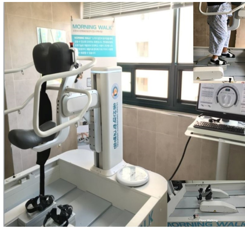
Figure 1 Picture of the end-effector type gait robot.

interest were 0.26 \text{ Nm/kg} , 0.05 \text{ Nm/kg} of standard deviation, 10 of the standardized difference, 0.05 of the \alpha value, 0.9 of power, and 20% of dropping ratio, and data of the 12 patients were calculated using Altman's nomogram. Statistical Package for the Social Sciences 21 (SPSS, Inc., Chicago, IL, USA) was used for the statistical analyses. PT and MRTD were compared using a Kruskal Wallis test and Mann-Whitney test with Bonferroni's method for post-hoc comparison, and the AUC was analyzed using the Wilcoxon sign rank test.