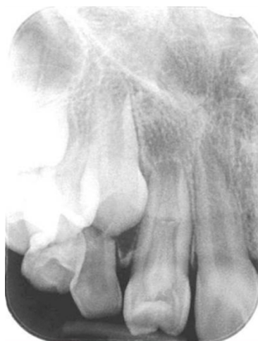
Figure 2 Periapical radiograph. The image shows a large elliptical space inside the invagination, and invagination of the dentin lined by enamel into the main canal space spreading into the apical part of the tooth root was observed. Tooth 12 appears to be associated with a large periapical radiolucent lesion around an immature root apex.