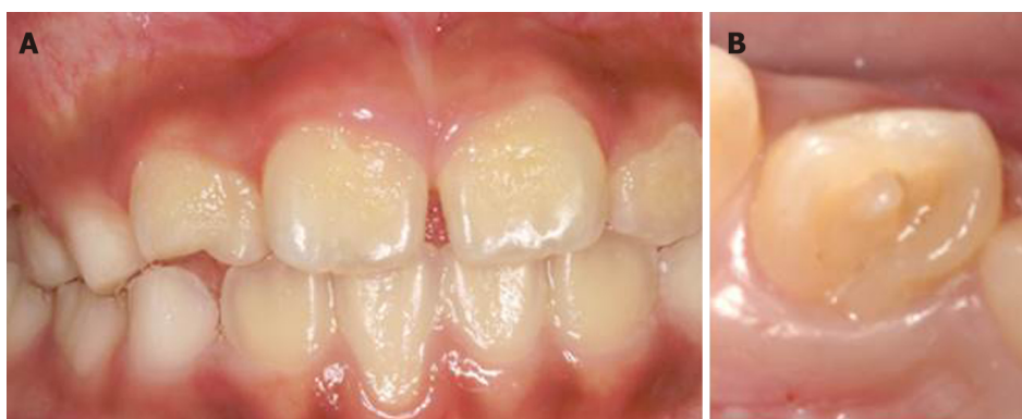
Figure 1 Clinical examination. A: The intraoral examination revealed normal soft tissue; B: Occlusal view shows a talon cusp and square-shaped crown.

surgical operating microscope (OPMI® pico, Carl Zeiss, Oberkochen, Germany) was used to explore the main root canal carefully to prevent any potential damage to the main root canal. Moreover, with respect to the information provided by CBCT imaging, the extent, position, and pulpal involvement of the invagination of the pseudo root canal of tooth 12 were accurately assessed (Figure 4B).