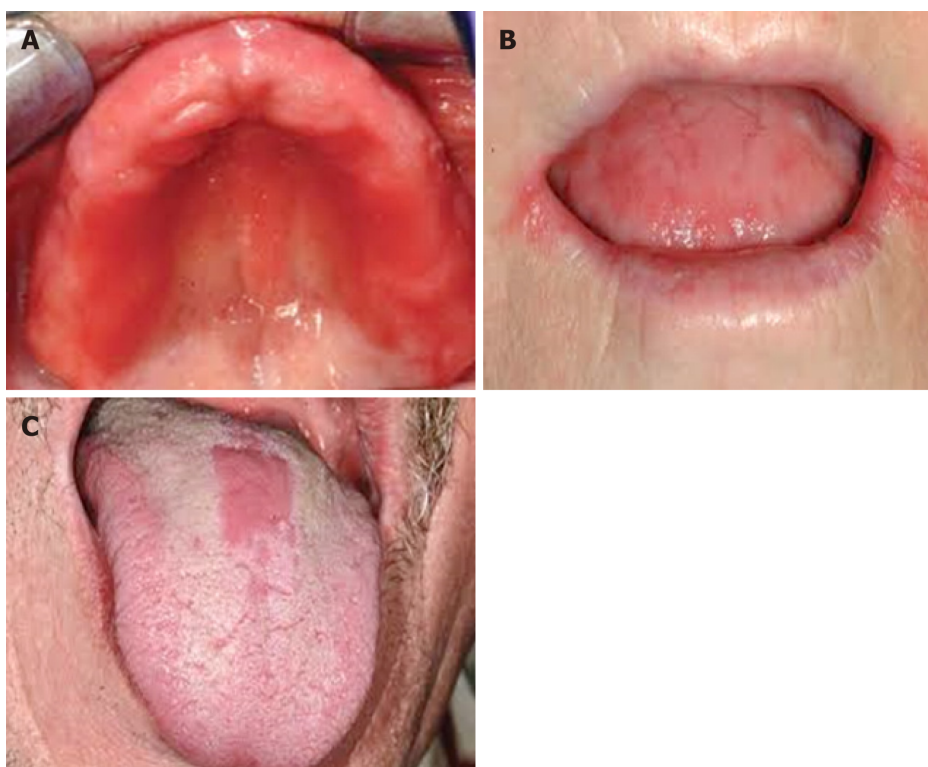
Figure 1 Candida-related lesions. A: Denture stomatitis; B: Angular cheilitis; C: Median rhomboid glossitis.

Oral complications in patients with DM are considered major complications of the disease and can impress the patients' quality of life. There is evidence that chronic and persistent oral complications in these patients adversely affect blood glucose control. Thus, prevention and management of oral complications due to diabetes are considerable.