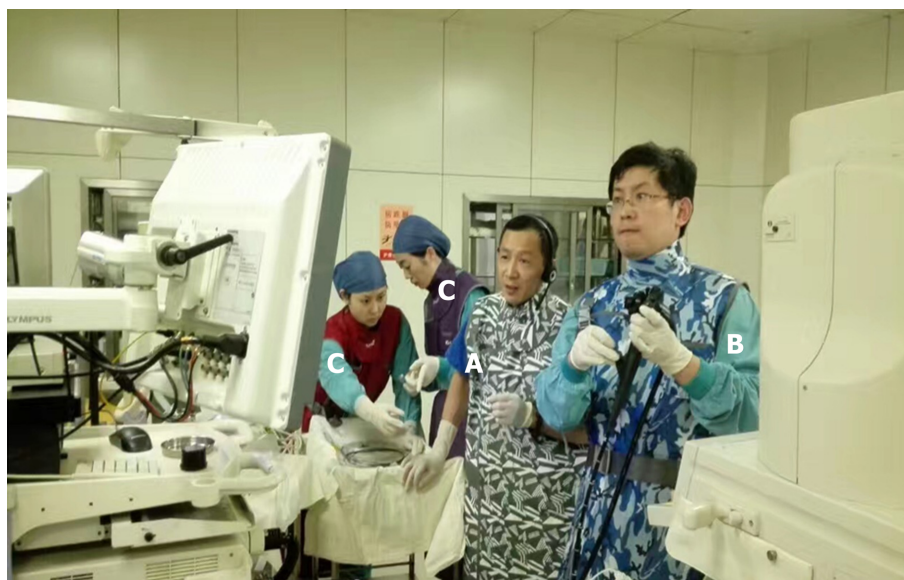
Figure 1 The entire operation team, including the general surgeon (A), endoscopist (B), and nurse assistants (C).

special type of upper GI tract reconstruction for discussion and then analyzed and attempted ERCP in this patient group with the aim of offering these patients minimally invasive treatments.