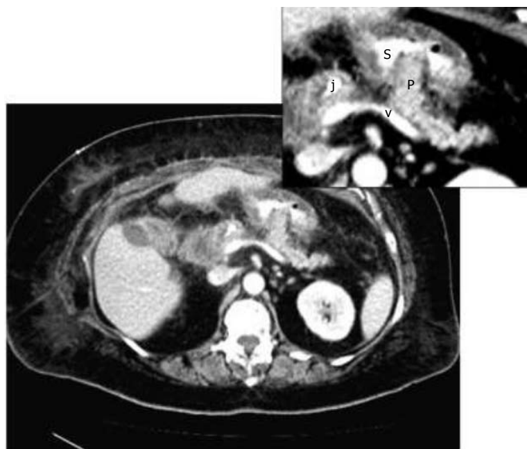
Figure 2 A scanner of the pancreaticogastrostomy in the early postoperative term. In enlarged view. p: Pancreatic stump throw the gastric wall; s: Gastric lumen containing oral contrast media; v: Splenic vein draining to the portal vein on the right side of the patient; j: High density image corresponding to the staplers of the cutting edge of the jejuna limb used in the hepatico-jejunostomy.

in the stomach immediately after a meal will be favorable for normal activity of the pancreatic enzymes. Therefore, the buffering capacity of the food may protect the pancreatic enzymes from denaturation at the time when they are required for digestion, and the PG may not be detrimental in the exocrine pancreatic function. When a PJ is performed, there is no concern about the acid pH, but the changing anatomy may provide a negative feedback following a high-caloric jejunal load which results in reduced exocrine secretion [30] .