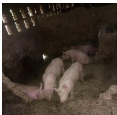
Figure 1 The pig farm environment.