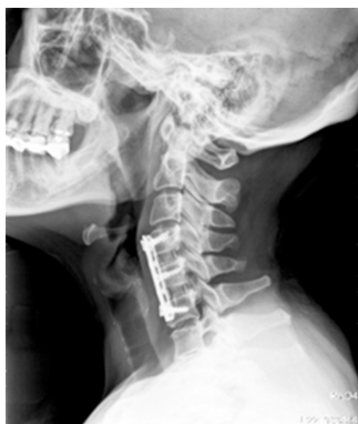
Figure 4 The X-ray showed that the patient underwent an operation involving an anterior cervical discectomy and fixation with two PEEK interbody cages and a plate at C4/5/6 vertebrae.