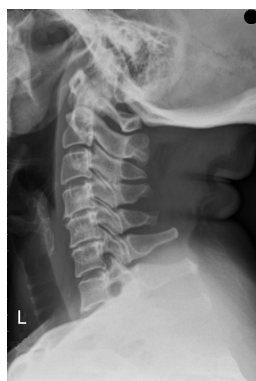
Figure 2 X-ray revealed marginal osteophytes with disc space narrowing at C4-5-6 vertebrae.

Hong et al [11] described that cervical spondylosis patients with sympathetic symptoms including headache, vertigo, dizziness, hypertension, nausea, vomiting, or tinnitus may be treated successfully with ACDF surgery using PEEK cages [11-13] . They named these conditions “cervicogenic” headache [14] , vertigo [8] , dizziness [12] , or hypertension [13] . Therefore, we have named the condition we encountered in this case “cervicogenic exophthalmos.”