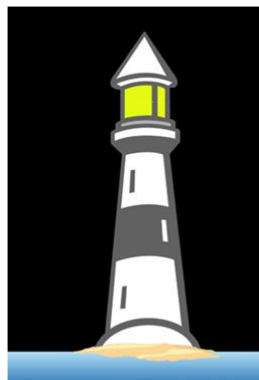
Figure 2 The Lighthouse test.

One important implication of this study is that formal testing using any conventional test can assist delirium detection – all tests were quite sensitive to the presence of delirium but the Vigilance A and B and the MBT were the best individual tests in terms of overall accuracy. This is in keeping with previous studies that have included direct comparisons of cognitive tests in the identification of delirium in elderly general hospital inpatients and which have consistently found that bedside tests of attention (including sustained or vigilant attention) are sensitive to the presence of delirium, with the Months Backward Test emerging as the most versatile individual test [10,29-33] .