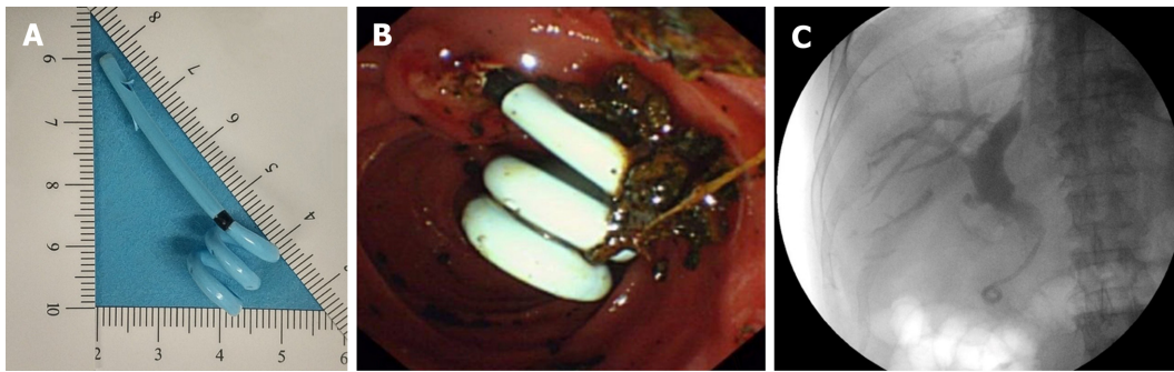
Figure 1 Biliary spontaneous dislodgement spiral stent and its clinical application in a patient who underwent mechanical lithotripsy for large stone removal. A: the 7-cm × 7-Fr biliary spontaneous dislodgement spiral stent with 12-mm spirals; B and C: the endoscopic and fluoroscopic view of the biliary spontaneous dislodgement spiral stent, respectively, after insertion into the common bile duct.