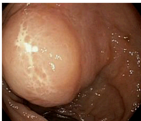
Figure 1 Findings at colonoscopy. A 3 cm submucosal pedunculated polyp is seen about 15 cm from anal verge.

history and physical examination did not reveal any evidence of extraintestinal manifestations.