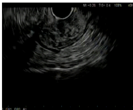
Figure 2 Findings with endoscopic ultrasound. A 2.8 cm × 15.2 cm avascular lesion of mixed echogenicity seen in the submucosa with no communication with muscularis mucosa or propria.

obtain tissue biopsy and exposure to ionizing radiation [27,28] .