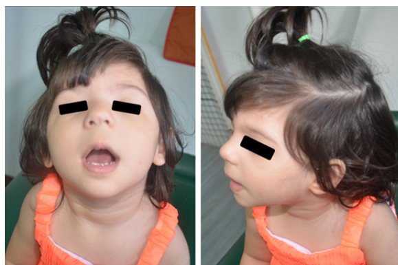
Figure 1 A patient with Wiedemann-Steiner syndrome. Her peculiar facial features include marked vertical narrowing of the palpebral fissures, hypertelorism, arched eyebrows, epicanthus, wide nasal bridge, low-set ears, and long philtrum.

selected for the molecular diagnosis of WDSTS. Recent cohort studies estimate a frequency of about 60%; hairy elbows can be associated with hypertrichosis of the back and/or generalized hypertrichosis [38,39] .