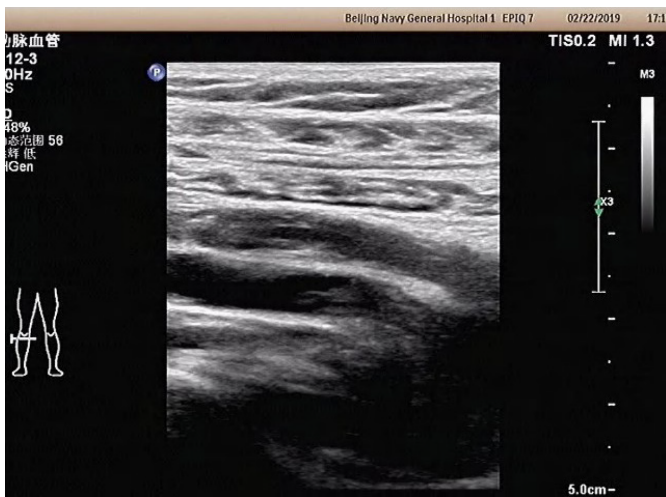
Figure 1 Doppler ultrasound revealed a deep venous thrombosis in the right popliteal vein.