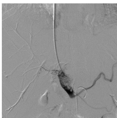
Figure 3 Portal venogram in a 37-year-old man with hepatocellular carcinoma and lung metastasis, who was treated with transjugular intrahepatic portosystemic shunt for severe varicosis and vomiting blood for 5 d. The tumor thrombus was located in the trunk and both left and right branches of the portal vein, and needle puncture was performed in the portal bifurcation. After injection of contrast agent, tumor thrombus was seen as an expansive growth with loose texture, with clear imaging of the portal vein branches.