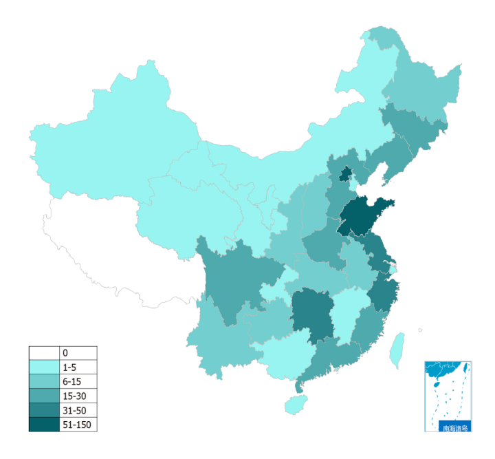
Figure 1 Distribution of medical students participating in this survey across China (n = 552).