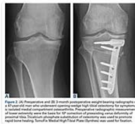
Figure 2: (A) Preoperative and (B) 3-month postoperative weight bearing radiographs of a 47-year-old man who underwent opening wedge high tibial osteotomy for symptomatic isolated medial compartment osteoarthritis. Preoperative radiographic measurements of lower extremity were the basis for 10° correction of preexisting varus deformity of proximal tibia. Tricalcium phosphate substitution of osteotomy was used to promote rapid bone healing. TonicFix Medial High Tibial Plate (Synthes) was used for fixation.