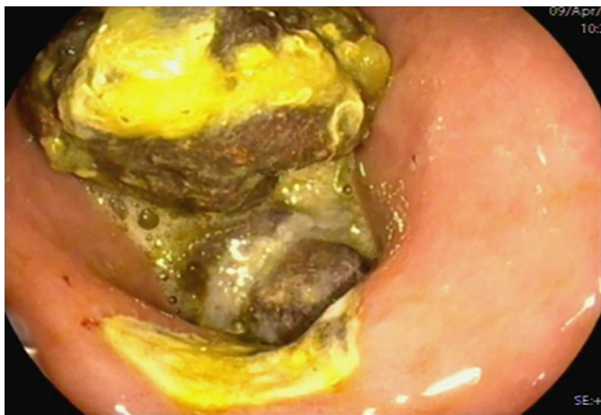
Figure 1 Gastroscope before admission revealed a gastric ulcer and a large bezoar in the stomach.