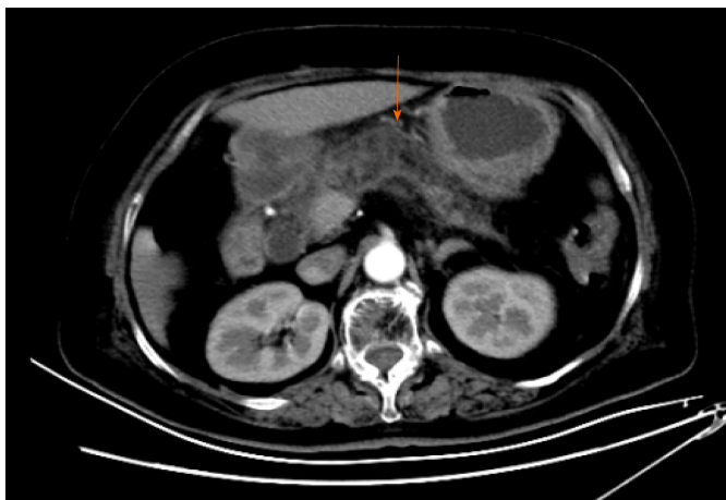
Figure 2 Abdominal computed tomography revealed mild inflammation of the pancreas.