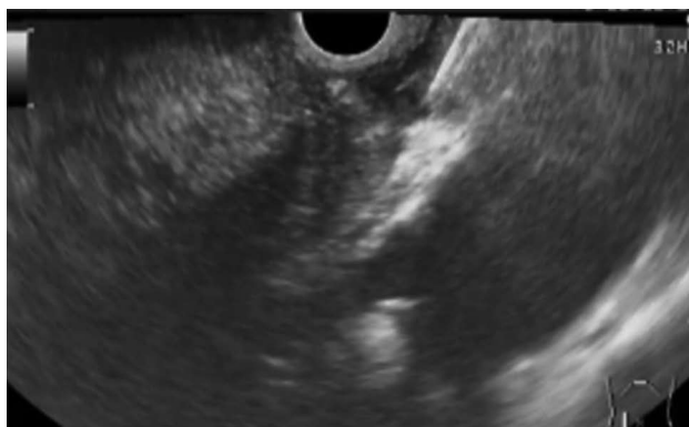
Figure 2 Endoscopic ultrasound images showing the position of the needle above the celiac plexus.

between the aorta and the origin of the celiac axis. If bilateral injection is chosen, the echo-endoscope, situated above the celiac axis, is rotated to one side until the origin of the celiac axis is no longer seen, and half of the entire solution is injected; the procedure is then repeated on the opposite side.