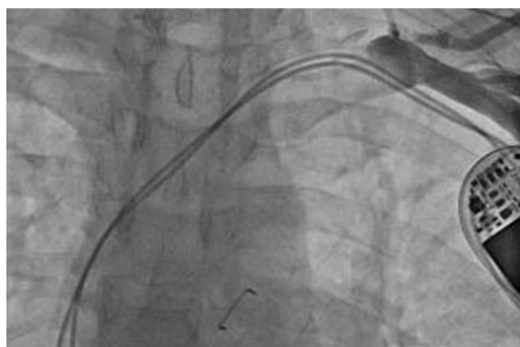
Figure 1 Venogram showing complete occlusion of the left subclavian vein.