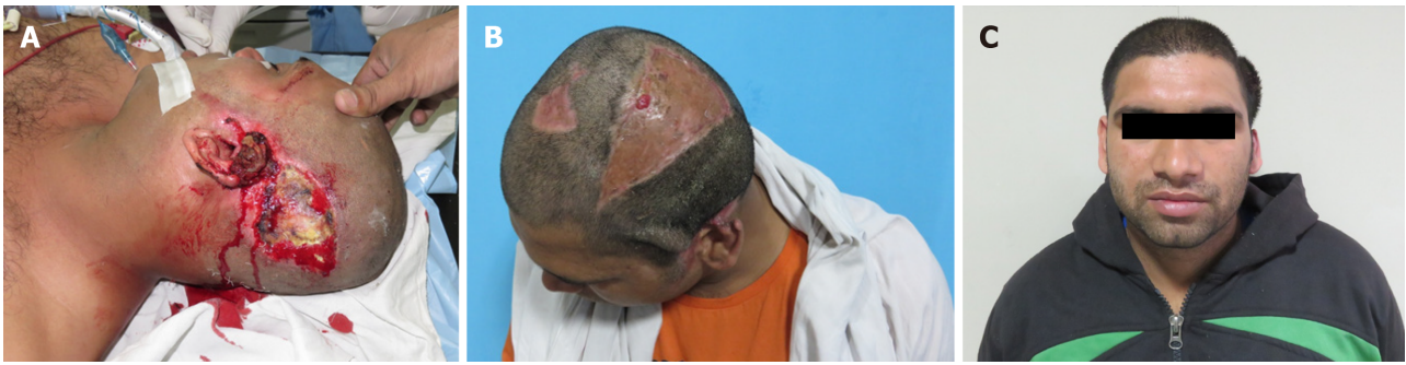
Figure 2 In most cases definitive cover was feasible during the second intervention. A: Electrical contact burns with the entry point at the left parietal region; B: Transposition flap cover after second debridement; C: Same patient shown in Figure 2A and B at 3 mo follow-up.