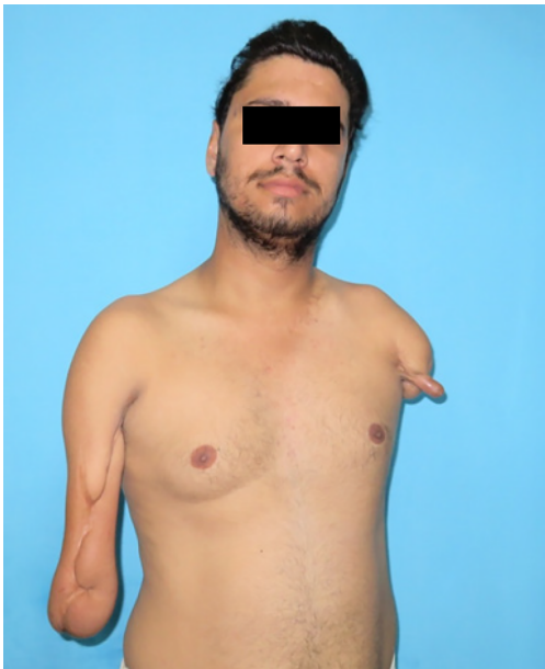
Figure 3 Bilateral amputee following electrical burns.

voltage burns underwent minor amputation of fingers. Also all 13 deaths during the study period occurred in patients with high voltage electrical burns.