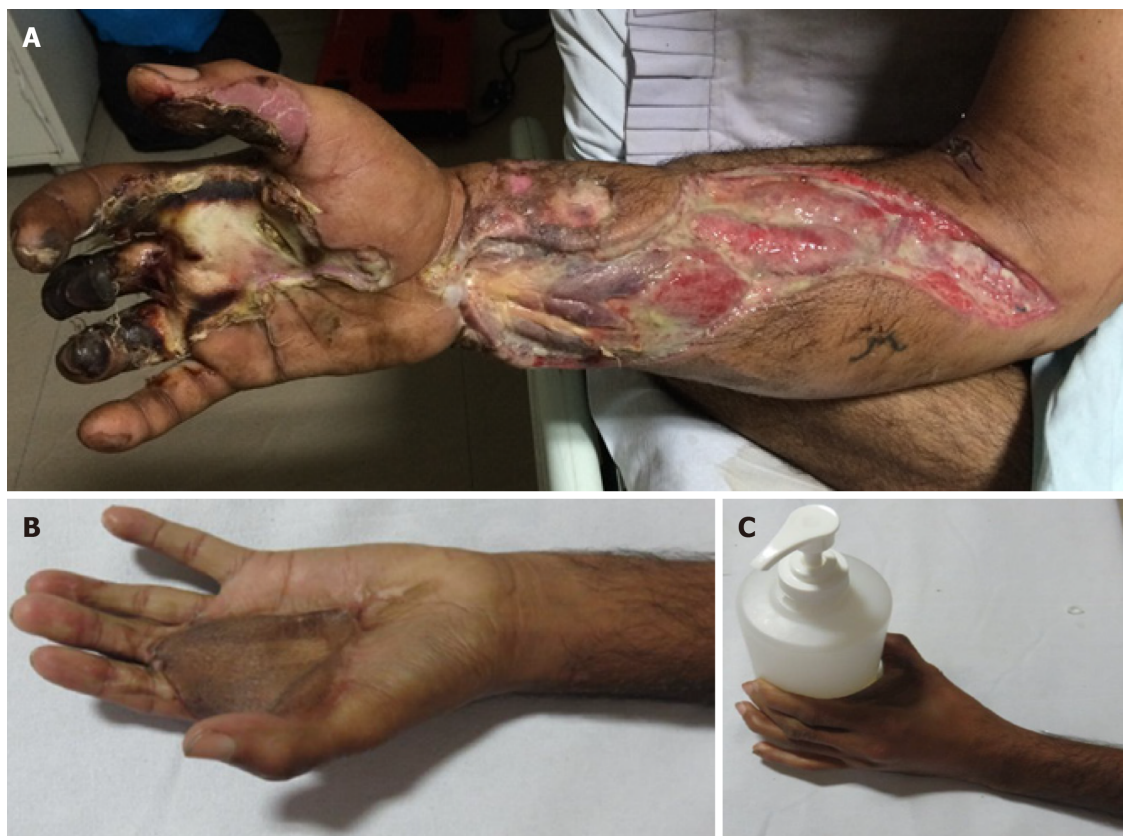
Figure 1 The injury may lead to limb loss and disfigurement of the victim which will have a lasting impact on the ability of the individual to return to work. A: Appearance on day 5 following fasciotomy in a high voltage electrical burns patient showing a gangrenous middle finger and ring finger along with nonviable tendons; B: Following skin necrosis due to electrical burns, debridement and a groin flap were performed; C: Same patient shown in Figure 1A and B using his injured hand to hold a bottle.