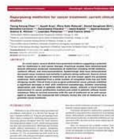
(PDF) Repurposing metformin for cancer... researchgate.net