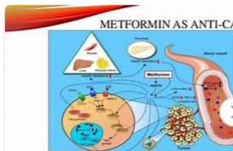
Metformin A Pharmacological Prespectiv slideshare.net

Explore Repurposing Metformin for The treatment of Gastrointestinal cancer