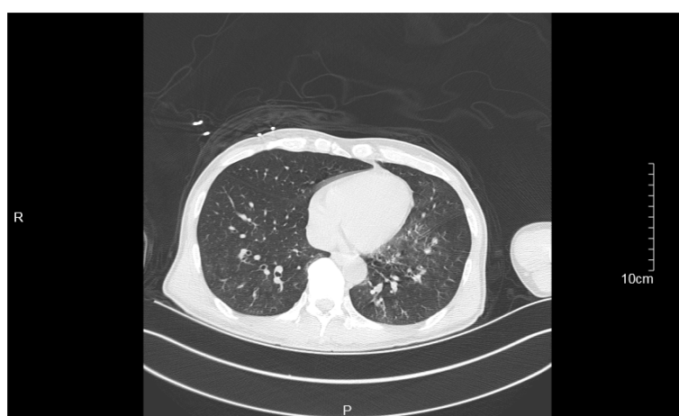
Figure 1 Emergency chest computed tomography. Emergency chest computed tomography indicated bilateral pneumonia with bilateral pleural effusion.